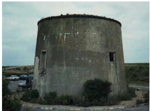
Martello showing window and doorway