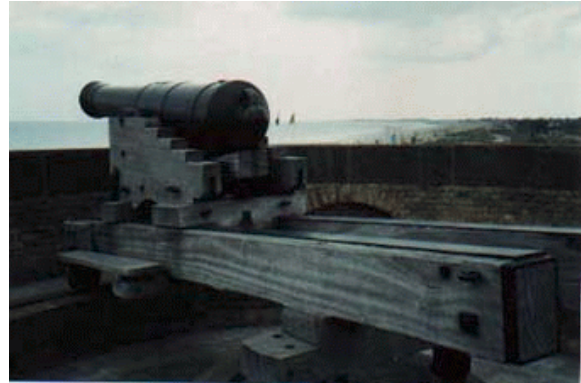
24-pdr cannon on central pivot

The majority lie disregarded and slowly decaying, surely a sad end for such wonderful constructions.