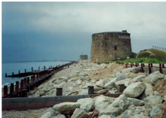
Two Martello towers near Hythe

It was argued that to have any chance of defeating the French invasion, then they must be defeated in the few days before the landings were complete. Disruption of the following waves of reinforcements was vital to avoid the possibility of the French overwhelming the army held in reserve. As early as 1798 a Major Thomas Reynolds suggested 'Simple towers of Brickwork' but was ignored. This suggestion was not one of original thought, it followed from previous experience.